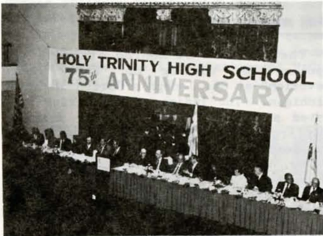
THE ANNIVERSARY DINNER HEAD TABLE READ LIKE THE 'WHO'S WHO' OF TRINITYLAND.