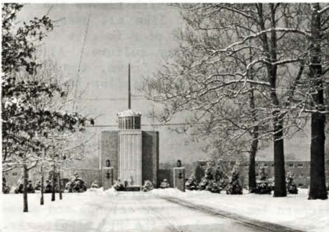
NOT ONLY DID THE SNOWS OF '85 ADD BEAUTY TO THE ENTRANCE OF THE BROTHERS' CENTER--