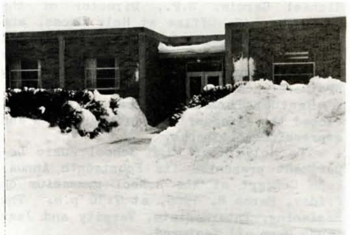
BUT ALSO ADDED MOUNDS OF SNOW AT THE JUNIOR COLLEGE TO CLOSE IT UP FOR FOUR DAYS.