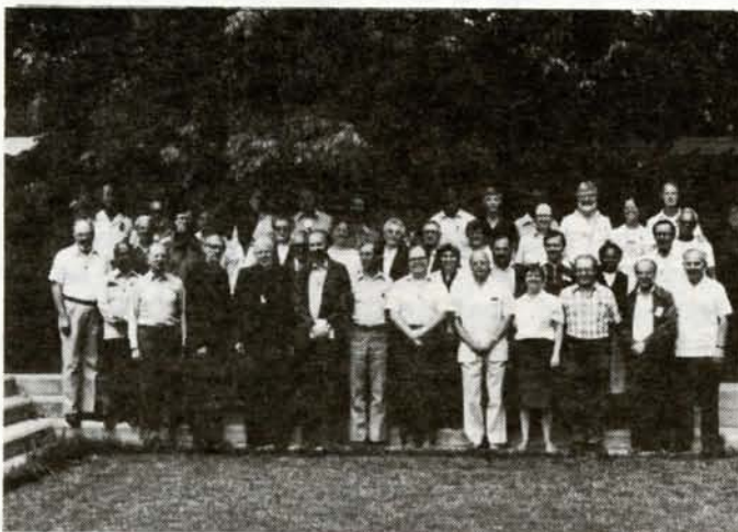
THE COUNCIL OF THE CONGREGATION AND THE ALL-HOLY CROSS LATIN AMERICAN GATHERING

The Inter-District meetings affirmed continued collaboration among the priests, Sisters and Brothers in Latin America.