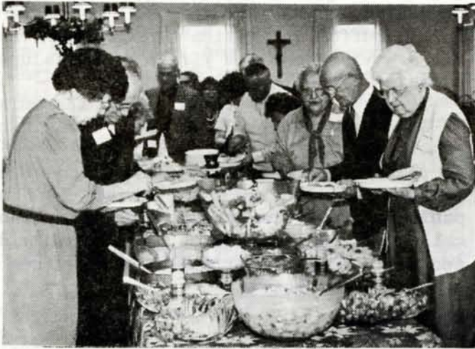
ENJOYING THE CHRISTMAS BUFFET AT THE CENTER.