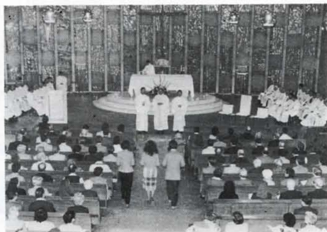
COMMUNITY HONORS FOUNDER OF HOLY CROSS.

The Liturgy was followed by a social and a splendid meal in the main dining room. Shortly after 8:00 P.M. an evening Vespers service was held to conclude the celebration of Moreau Day.