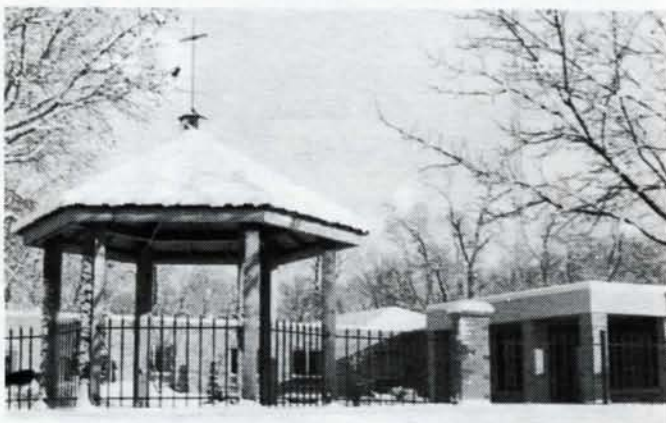
NEW GAZEBO IN THE BACK OF DUJARIE HOUSE.