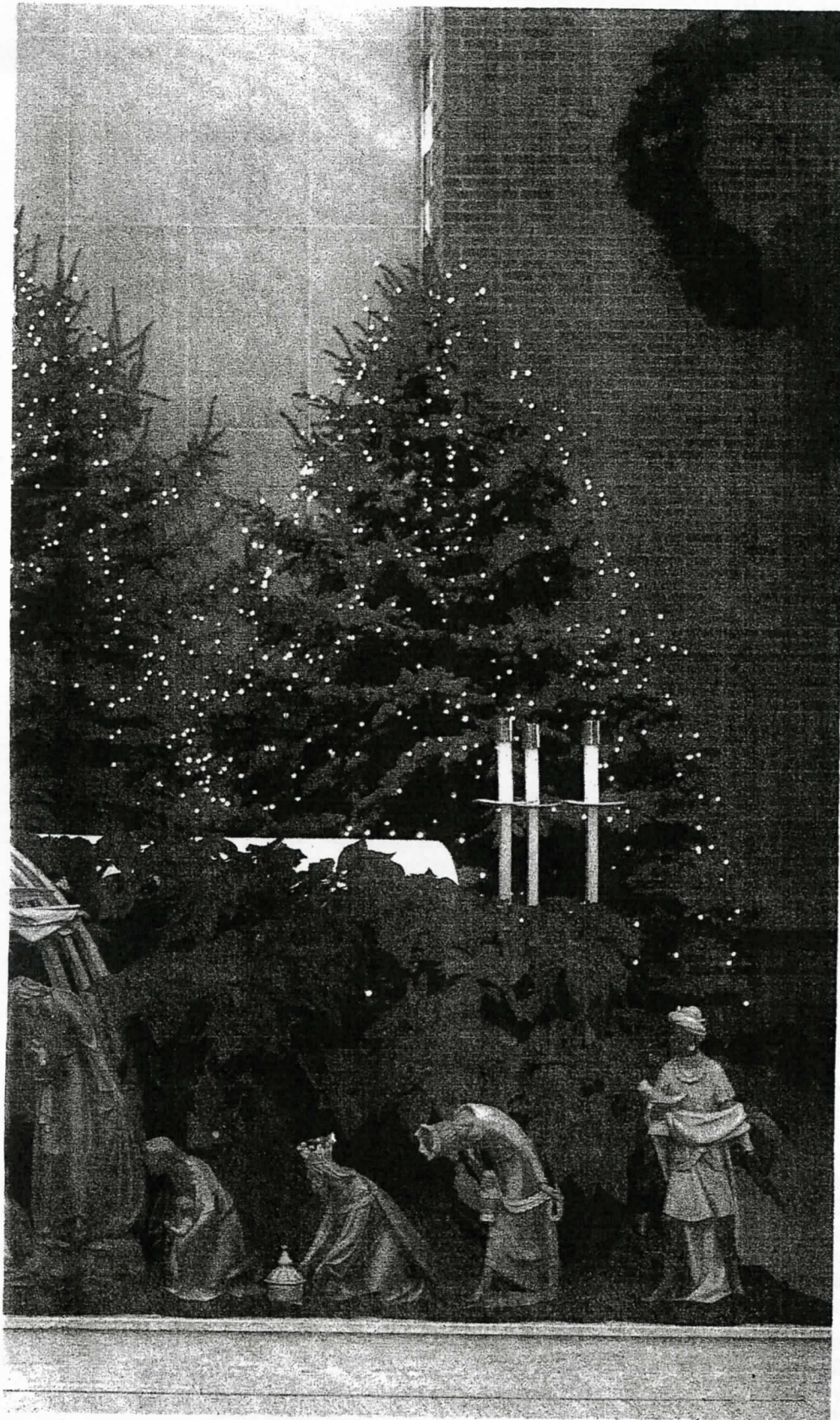
Christmas Scene Holy Cross Brothers Center Chapel