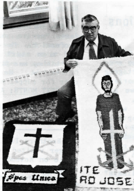
COMMUNITY SEAL AND ST. JOSEPH