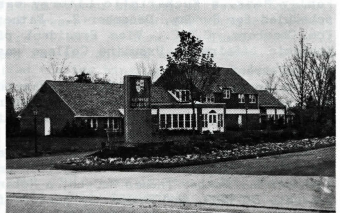
NORTH ENTRANCE AND PERFORMING ARTS CENTER