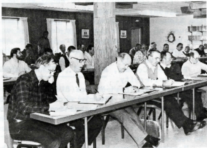
ELECTED CHAPTER DELEGATES IN FIRST SESSION

It was for the assembled delegates then to identify the issues that would be presented and discussed for the day in preparation for forming Chapter Committees. The overall plan for areas of concern and the selection of committees developed to date by the Provincial team were placed before the group. Several alternate plans were considered but the use of four committees covering Mission and Ministry, the Constitutions and Community life, Organization and Administration, and Finance were voted to be the most feasible.