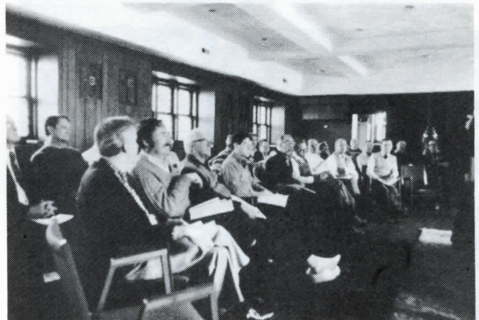
OHIO COMMUNITIES LISTENING TO PROVINCIAL PRESENTATIONS GIVEN AT GILMOUR ACADEMY.

+ Holy Cross Brothers from the Ohio area met at Gilmour Academy on February 22 for the opening of the provincial visitation in the state. The procedure was comparable to that written up on page one of the March issue of HCB.