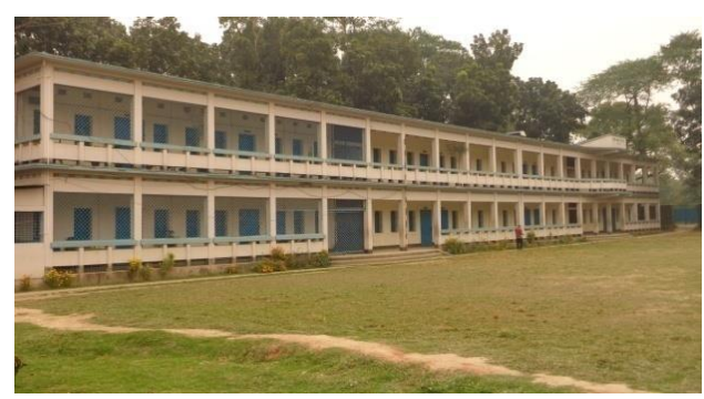
Tumilia Boys' High School