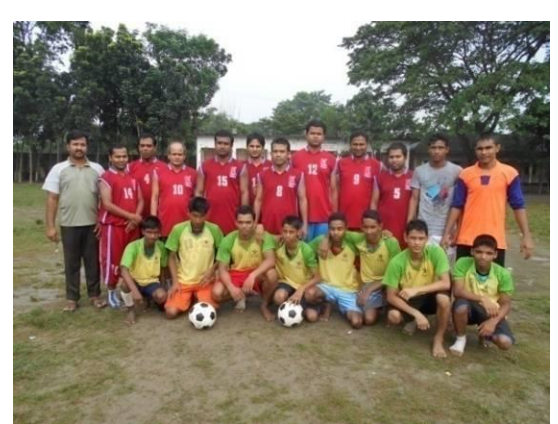
Before the start of a friendly match

A friendly football match: A friendly football match between the teachers and students was held on 8 September 2015 in the school play ground. The school wore a festive look on this occasion. The match started at 3 pm. The competition was not so serious at first. After a little while, it turned into a strong fight. Both the teachers and students encouraged their respective teams. The match was full of excitement. But none could score a goal. At last the tiebreaker system had been applied between the teams and the teachers' team won.