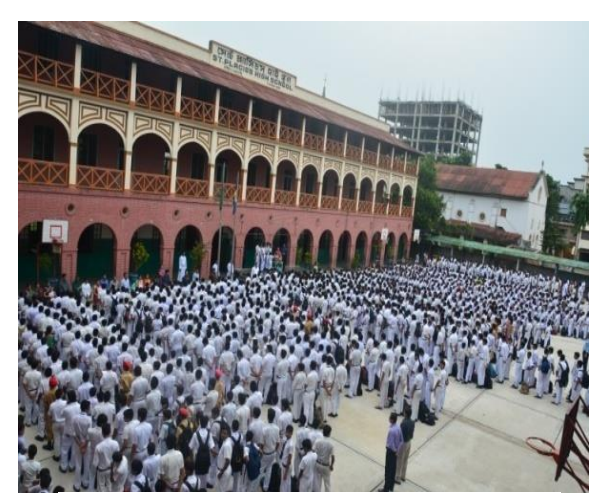
St. Placid's High School & College

St. Placid's High School was founded by the Anglo-Belgium Benedictine Missionaries in 1853. In 1955 the Anglo-Belgium Benedictine Missionaries handed over the school to Holy Cross Missionaries for their crisis of personnel and finance. Since then Holy Cross Priests were running this school up to 1922. In 1922 the Holy Cross Priests handed over the school to Holy Cross Brothers. The founding name of this school was Bandel Catholic Free School. Afterwards, in 1883 the name was altered from Bandel Catholic Free School to St. Placid's School. On 28 July, 2015, having received the permission of the Ministry of Education of Bangladesh St. Placid's School has been upgraded to a college, henceforth, the school is known as St. Placid's High School and College.