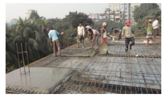
The construction of fourth floor is underway

Renovation and Extension work: Our house renovation work began with roof repairing work. Bro. Linus D' Rozario, is monitoring the work. There was a dusty and noisy environment for least a couple of months. The new fourth floor will be used as residence for the hostel boys.