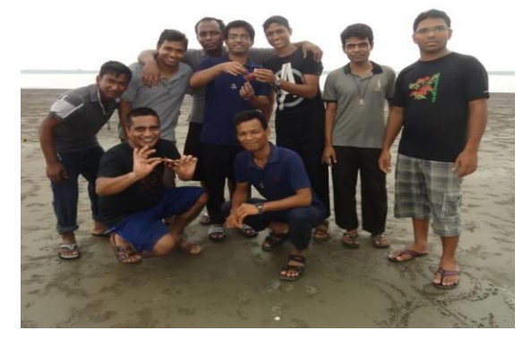
Figure 1: Scholastics and the director having fun

Study Tour 2015 : This year, scholastic brothers went for a study tour at Kuakata Sea Beach. We started our journey from Dhaka on 5 September night and reached at Kuakata next morning. We roamed around the sea beach whole day and had lots of fun. We also played football on the sea shore. We stayed a night over there and refreshed our mind.