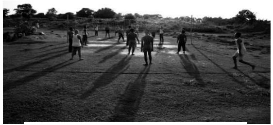
Clients enjoying a volleyball match

Daily Activities: Clients take part in various activities on a regular basis like didactic classes, occupational therapy, counseling, NA meeting, sports and games which help them come out gradually from the clutch of drug addiction.