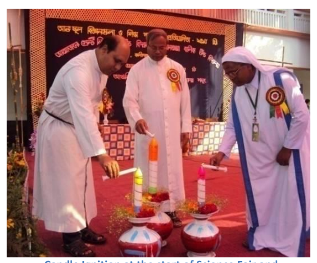
Candle Ignition at the start of Science Fair and Cultural Competition

Science fair & Cultural competition: Saint Nicholas High School has been organizing Science Fair & Cultural Competitions in Gazipur at Bhawal region for a long period of time. Accounting to its tradition, this time also we organized a Science fair & Cultural competition. The program was held from 24 to 27th of February, 2015. About 36 schools participated in the Science Fair and Cultural Competition.