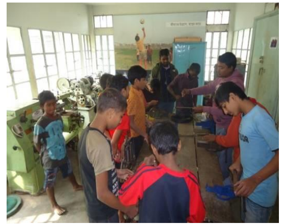
Little patients receiving technical training

Participation in Training Conference: A few staff and the Director participated in training conference both in Dhaka and Malaysia and Bangkok. One such meaningful training was "Training of Treatment Practitioners from Bangladesh, India and Pakistan on Child Drug Addiction Treatment". This is a new training and fills a bit of the gap in assistance that is to be used for children. We were surprised and encouraged to find out that the expert participants from India and Bangladesh who visited our facilities recognize the type of Children's Program that APON has is unique for both countries.