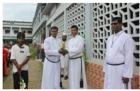
Farewell and Reception program