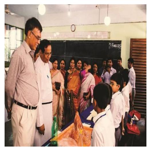
The Principal visiting a project