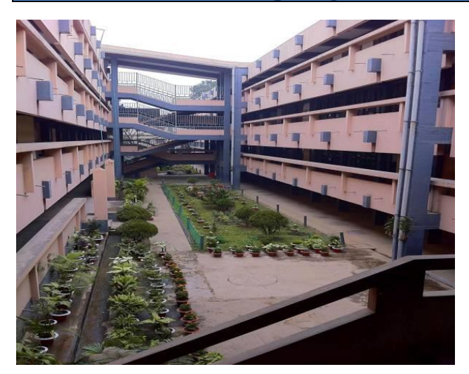
St. Joseph Higher Secondary School

St. Joseph Higher Secondary School is a Catholic higher secondary school in Mohammadpur, Dhaka, Bangladesh. It is a all boys' school offering education from third grade to twelfth grade, averaging 8–18 years of age. The school is a single shift school. With over 2700 students, St. Joseph Higher Secondary School is one of the most prominent educational institutions of Bangladesh. Established in 1954 as the "St. Joseph English Medium School" in 16 Munir Hossain Lane, Narinda in the current old part of Dhaka by the Congregation of Holy Cross missionaries, the institution had a General Certificate of Education (GCE) based education structure. The current campus is at 97, Asad Avenue, Mohammadpur, Dhaka. The school also runs an evening primary school for underprivileged students number about 200.