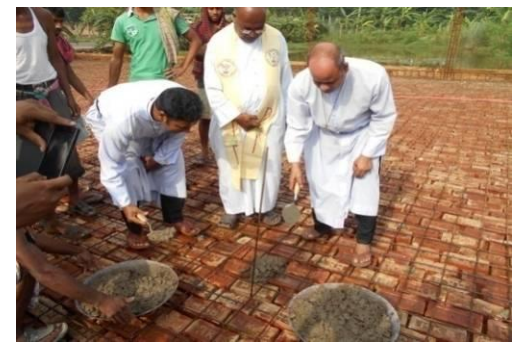
Inaugurating pouring of the basketball field

Tumilia Boys' High School is situated at Tumilia Parish under Kaligonj Thana, Gazipur. Tumilia Boys' High School was founded in 1965.