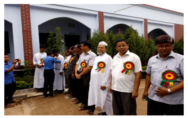
Due respect and honor paid to teachers

Teachers' Day celebration: The school celebrated 'Teachers' Day' on 20<sup>th</sup> November. Students showed there respect with appreciation and love for their beloved teachers. A grand cultural function was organized by students where students mesmerized everyone with singing, dancing, recitation etc.