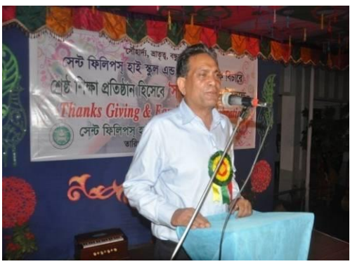
Board Chairman delivering speech

Achievement: St. Philip's celebrated family day and thanksgiving ceremony with the presence of near about 400 people of the families of teachers and staffs on 22 September as St. Philip's High School and college was awarded the Best Institution in Dinajpur Sadar among 222 Schools; Prize money one lakh taka for securing 100% pass in SSC for consecutively for three years. Seqape a section of Bangladesh Education Ministry, awarded this prize. The Education Board Chairman, the Police Super of Dinajpur and many other educational officials of different levels were present in the program.