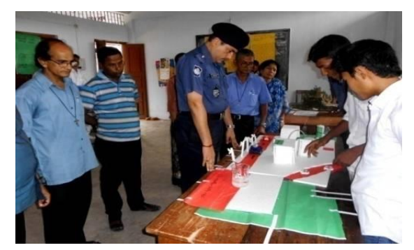
Distinguished guests visiting a project

Inter-School Science Fair: An Inter-School Science-Agriculture-Industry Fair was held on 27 April 2015 at Don Bosco High School. It was organized by Don Bosco High School. Bandarban Govt. Girls' High School, Sangu High School and Don Bosco High School took part with 55 projects in this fair. In appreciation of their excellent performance students were awarded prizes.