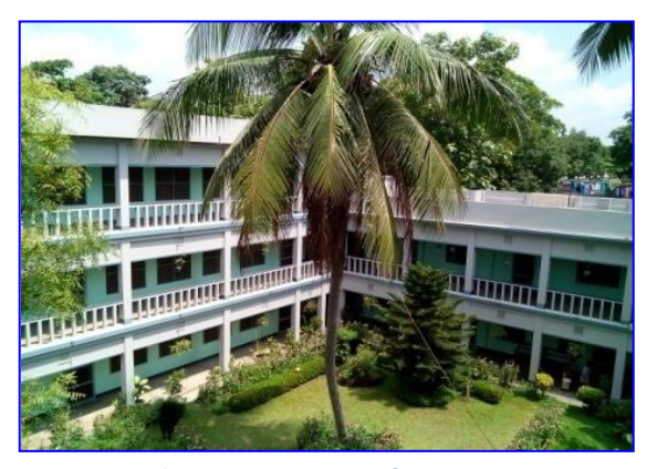
Halcyon Environment of Juniorate

Holy Cross Juniorate is the first stage of formation for the Brothers of Holy Cross in Bangladesh. In the beginning, the formation program was started in Little Flower Seminary at Bandura. Then it was shifted at Nagori under Gazipur District in 1969.