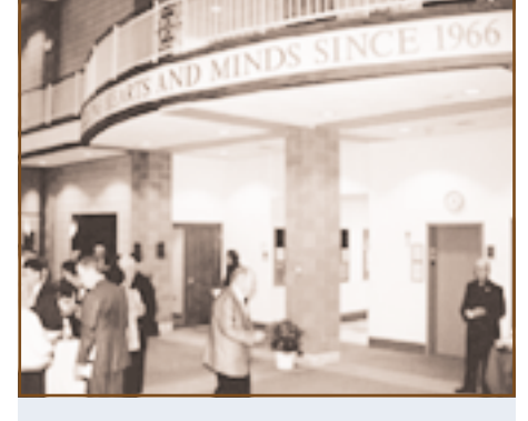
Vincent Hall Atrium, Holy Cross College

more than kept tempo with the maturation of the campus flora. Like those first shoots and saplings — now well-rooted, sturdy flora of flourishing shrubs and shade trees — Holy Cross College continues to develop with the exuberant hope and