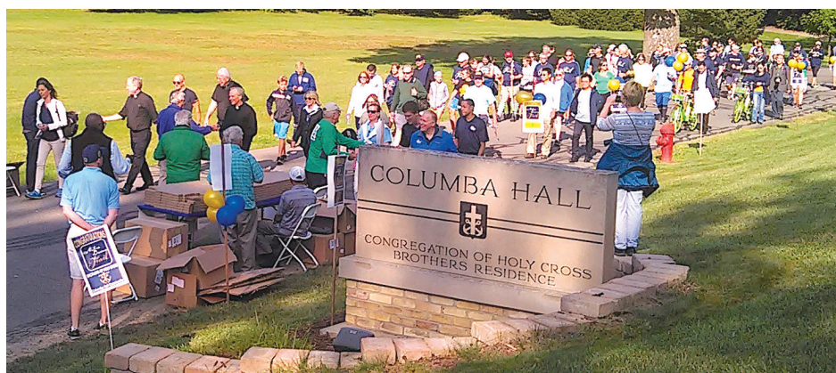
Over 2,000 walkers participated in the final three miles of the Notre Dame Trail on Aug. 26. They stopped at Holy Cross Cemetery to pay respects to Father Sorin and the brothers buried there, continued to the Notre Dame Grotto, then celebrated an outdoor Mass on the Bond Hall Quad, near where Father Sorin first arrived.