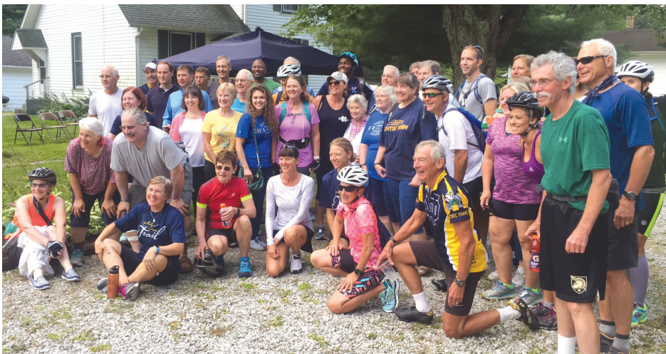
Thirty-two "pilgrims" traveled the route that Father Sorin and six brothers journeyed 175 years ago to build the University of Notre Dame. The Notre Dame Trail began in mid-August with a celebration of more than 2,000 people participating on the last day.