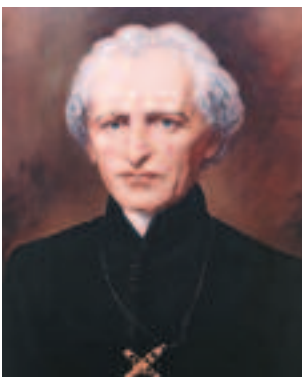
BLESSED BASIL ANTHONY MOREAU FOUNDER CONGREGATION OF HOLY CROSS