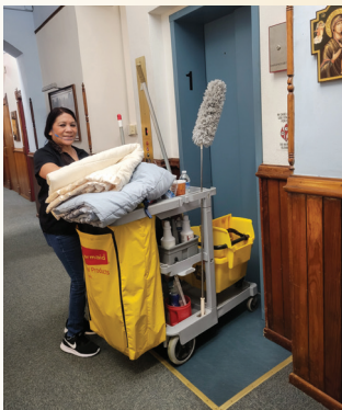
The housekeeping staff use the elevators to transport their equipment.