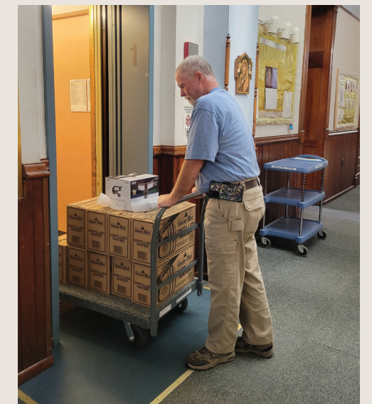
The maintenance staff uses the elevator often—moving heavy loads, house supplies and large tools to help in repairs around Columba Hall.