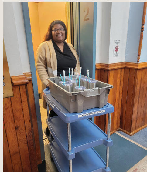
One of our CNA's brings fresh water to some brothers' rooms twice a day. If anyone got COVID, the brothers had to stay in their rooms and their meals were brought to them by the staff.