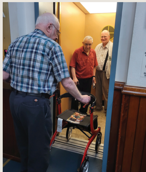
Close to 50 percent of the brothers use a walking aid such as canes, wheelchairs, scooters or walkers making an elevator an absolute necessity.